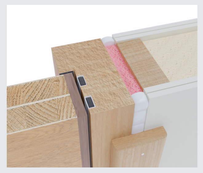
FAS Fire Door Silicone Sealant with FAS Fire Door Foam<sup>™</sup> for joint widths up to 30mm to achieve fire ratings of up to 60 minutes when applied correctly.